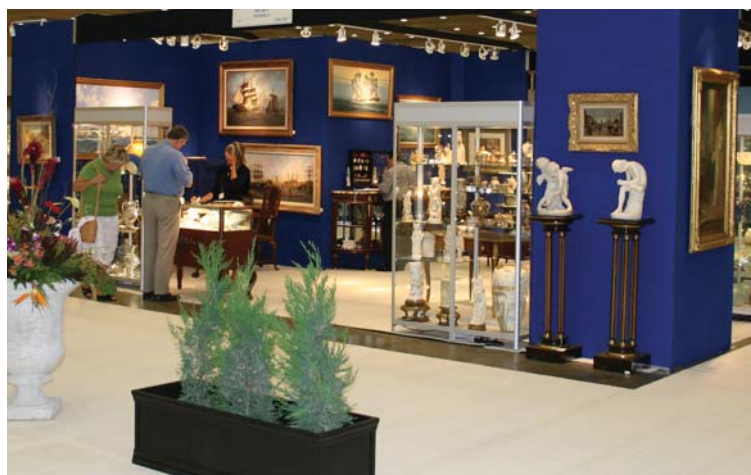
Booth of A.B. Levy Antiques.

For more information visit www.baltimoresummerantiques.com