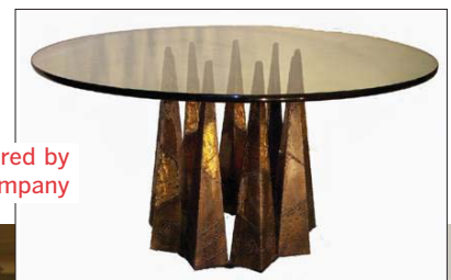
Paul Evans table offered by Wells and Company