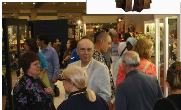
Record attendance filled the show with over 30,000 attendees over four days.