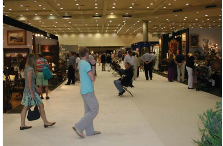
The main aisle showing a selection of the 550 booths in the show.

P. O. Box 9221, New Haven, CT 06533 tel: 203.927.4010 fax: 203.776.2878 masonfineart@hotmail.com www.antiquesandfineart.com/thomasmason By appointment